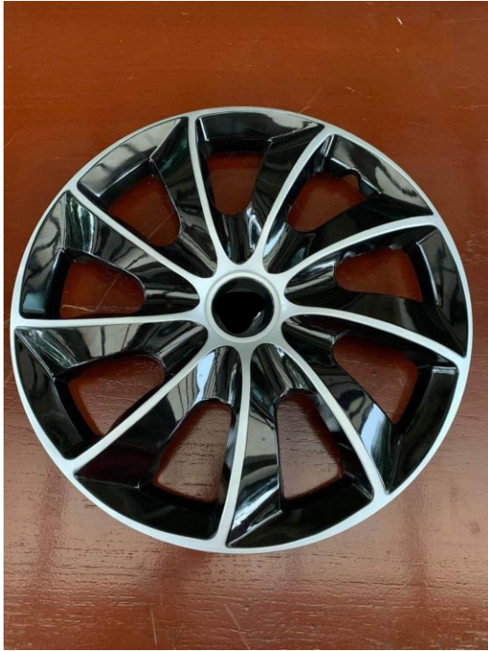
Toyota Hiace Hub Cap