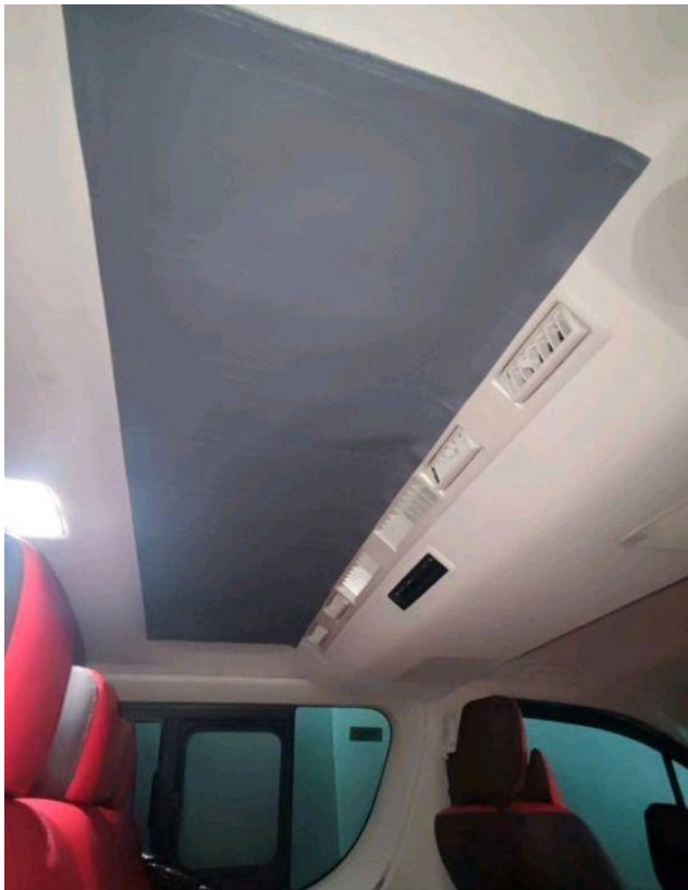
Ceiling Cover for Toyota Commuter/GrandiaGL