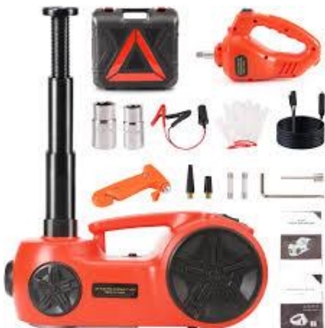
5in1 Tire Jack